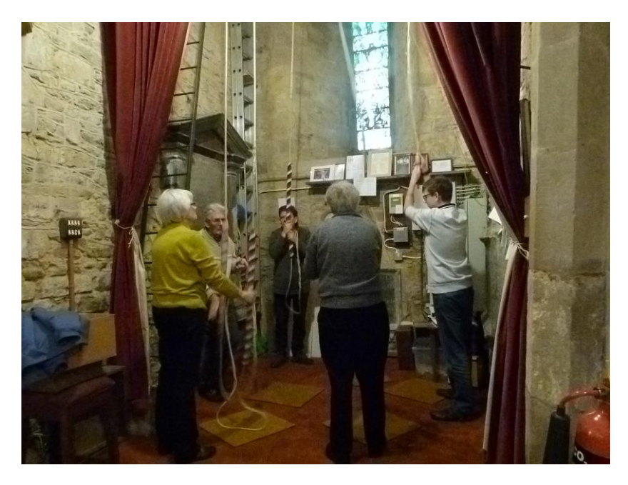
BELLRINGERS AT WORK ON 11 NOVEMBER 2018

The bell ringers practise once a week and are members of the Daventry branch of the Peterborough Guild of Church Bellringers, who meet monthly.